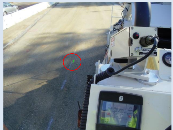
Gun Carriage Guidance - The laser is used to give the operator "heads up" time to move the gun carriage in and out for easy and precise alignment.